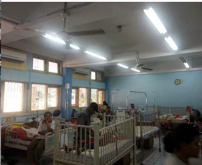
↑ family living at hospital