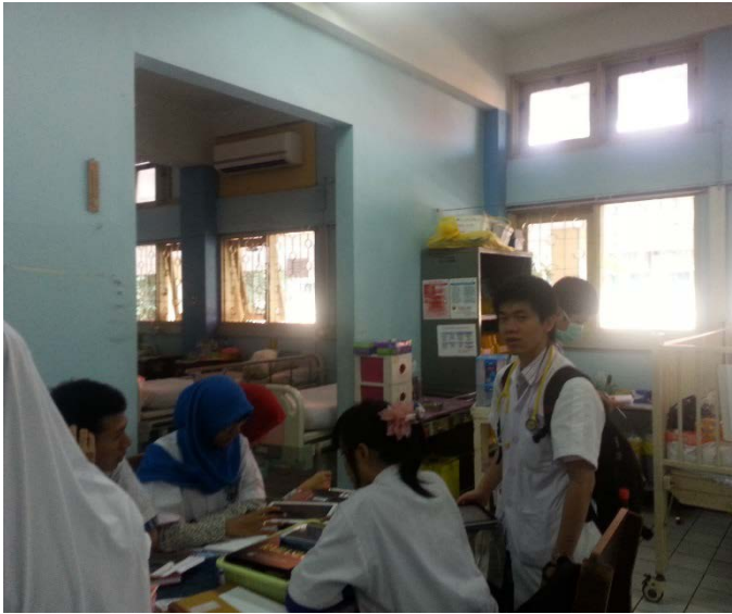
Room for TB patient with no barrier

And there are too many patient to isolate each one, she said. So, they allow patients to live freely. This difference is most surprising experience for me. I realize that medical standard in Japan isn't always standard in other countries, In pediatric ward, except TB there are interesting cases. For example, infant with HIV, tropical disease patient... Every disease hardly watch in Japan, so it was exciting experiences.