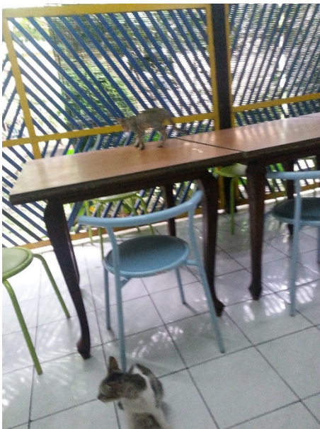
↑ cat living at hospital

For example I said because of patients' family, hospital become dirty, but in other words we can say that the bond of family is very strong, so they live near their pity family member. My Indonesian acquaintance said so. So at least about this problem, we cannot deny easily because it reflects their nationality.