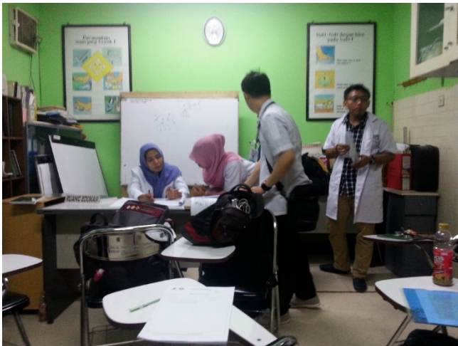
↑ education scene

With this 2 differences I think in Indonesia students are considered as like doctor. In Japan, during BSL all we can do is taking history or physical exam. and, it's even just confirmation of doctors' work. The other thing we can do is just observation. There are less responsibility than in Indonesia. Of course this difference protect us from problem but in terms of education, we have to refer to Indonesian system to some extent.